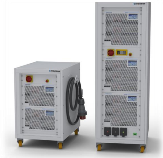
Figure 4: REGATRON's rack-integrated turn-key system solutions with various power levels e.g. 72 kW (left) and 162 kW (right). Various types of AC/DC connectors and cables allow for comfortable handling. Third-party product integration and numerous safety options are additional features.