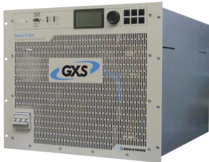
TC.GXS Series unit with optional Human Machine Interface (HMI)