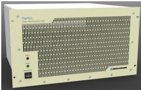
Linear Post-Processor Unit