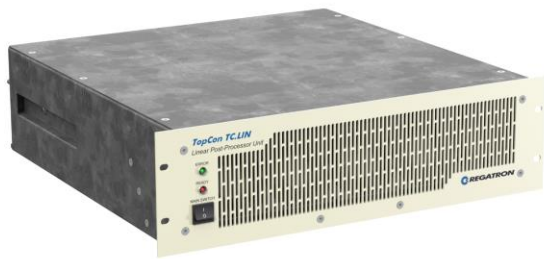
Linear Post-Processor Unit TC.LIN