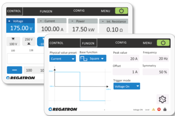
Figure 3: Intuitive control by HMI touch display. Everything you need at a glance.

With the remote control unit (RCU) it is possible to control the device or system from a distant location in the same manner as with the HMI.