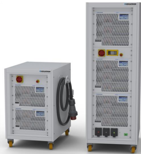
Figure 4: REGATRON's rack-integrated turn-key system solutions, e.g., 72 kW (left) and 162 kW (right) power levels. Various types of AC/DC connectors and cables allow for comfortable handling. Third-party product integration and numerous safety options are additional features.