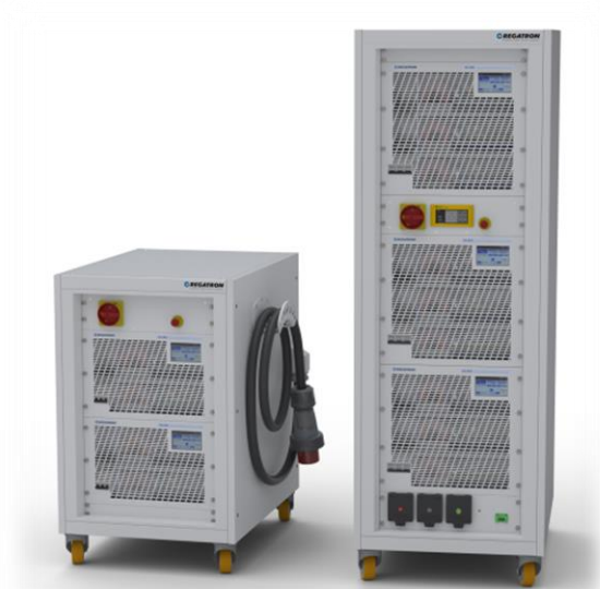
Figure 3: REGATRON's rack-integrated turn-key system solutions, e.g., 72 kW (left) and 162 kW (right) power levels. Various types of AC/DC connectors and cables allow for comfortable handling. Third-party product integration and numerous safety options are additional features.