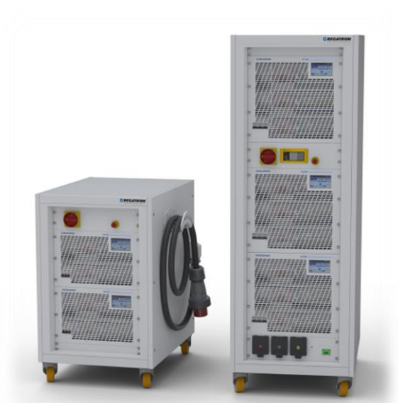
Figure 4: REGATRON's rack-integrated turn-key system solutions, e.g., 72 kW (left) and 162 kW (right) power levels. Various types of AC/DC connectors and cables allow for comfortable handling. Third-party product integration and numerous safety options are additional features.