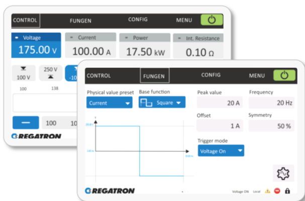
Figure 3: Intuitive control by HMI touch display. Everything you need at a glance.

With the remote control unit (RCU) it is possible to control the device or system from a distant location in the same manner as with the HMI.