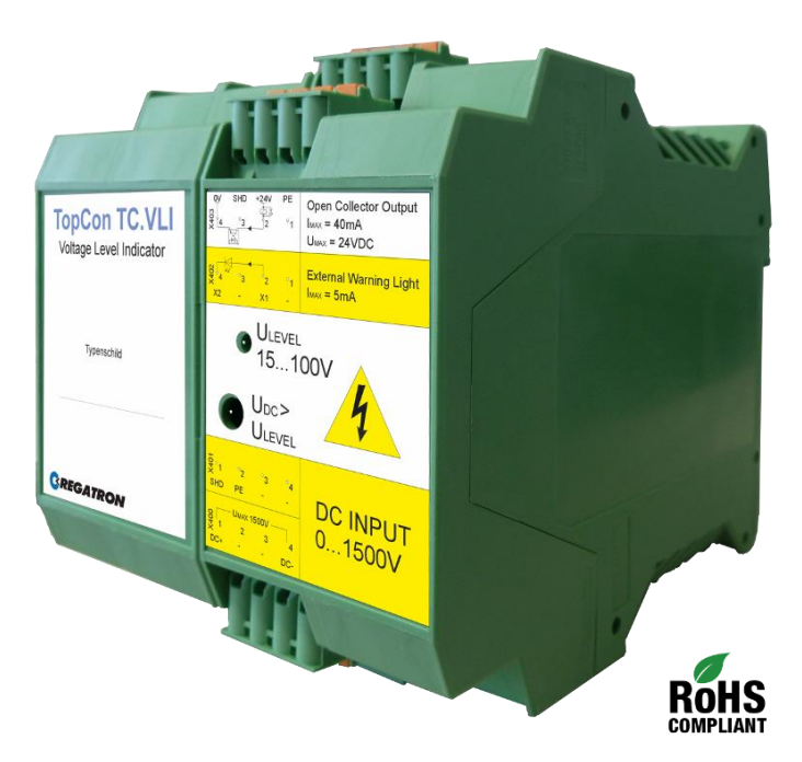
Figure 1: TopCon TC.VLI unit

REGATRON developed a completely self-alimenting and brand independent indicator unit specially designed for the purpose to monitor the DC voltage level across two electrical lines of interest.